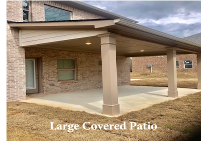
Large Covered Patio